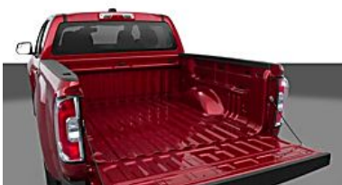
It's Hard to Believe These 10 Cool Cars Cost Less Than $25,000 (Kelley Blue Book)