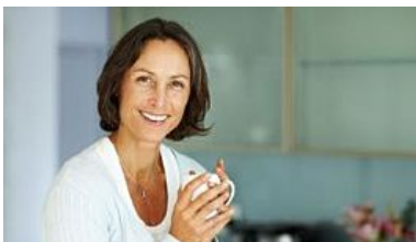
What causes restless legs syndrome?