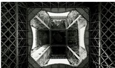
How a creationist instinct stops us seeing evolution everywhere