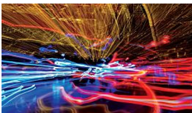
Quantum technology set to hit the streets within two years