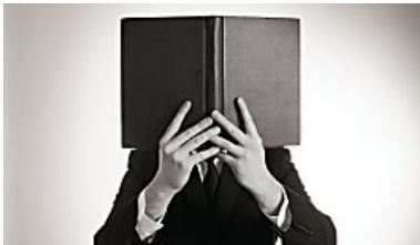
Win the CultureLab science books of 2015