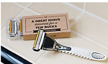
How This Razor is Disrupting a $13 Billion Industry It Couldn't Be Simpler (Dollar Shave Club)